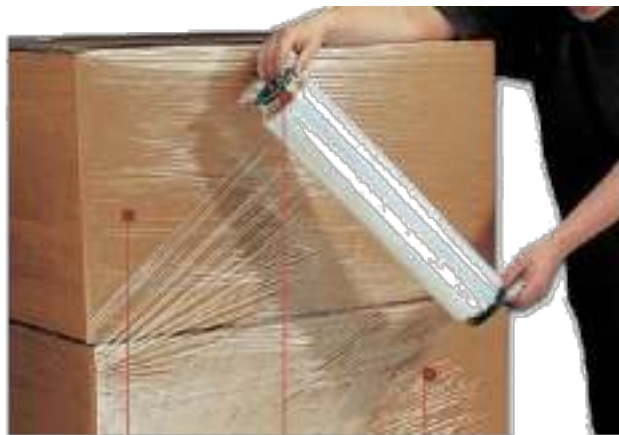
Holds Shipment Together Can Be Used With Manual Dispenser Softness & Flexibility with Cling Grip to Packages