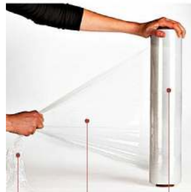
Hand Roll for Manual Used